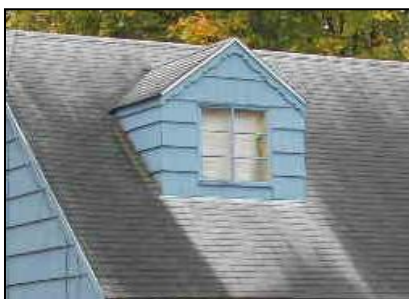
Extensive algae growth

Algae require moisture and proper temperatures to grow. Dew is the primary moisture source. Algae are found predominantly in the Southeast, but it can and will grow nationwide. The algae generally grow on the northern exposures of the roof since this exposure generally receives less sunlight. Algae are well adapted to extreme conditions.